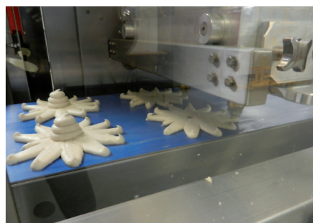
Complex Shapes and Designs