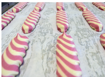
2 Colour Eclair with Twist