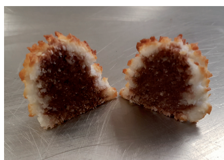
2 Colour Coconut Macaron