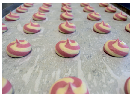
2 Colour Drops with Twist