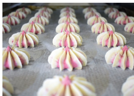
2 Colour Star Flower Drop