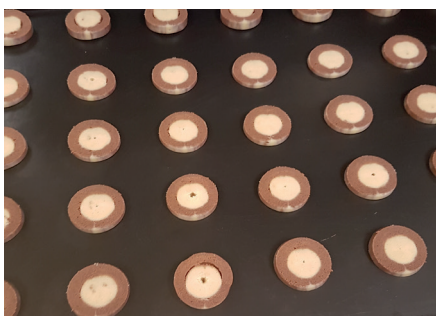
2 Colour Wirecut Biscuits