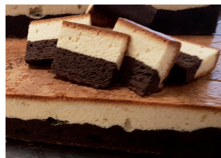
2 Coloured Layer Cake in 1 Pass