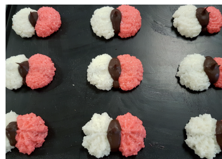
3 Colour Coconut Drops