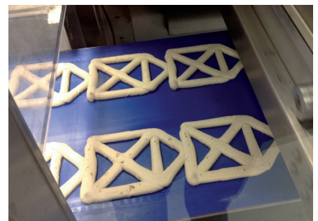
Complex Shapes and Designs