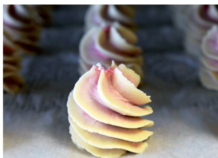
2 Colour Tower with Twist