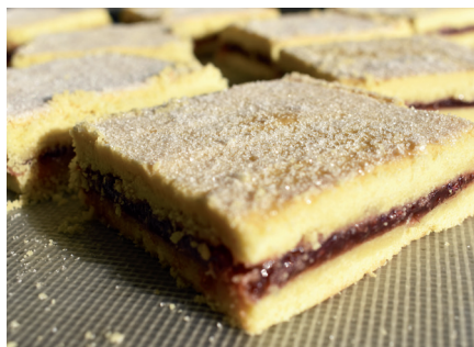
3 Layered Sheetings in 1 Pass