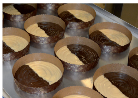
2 Coloured Sponge Cakes Half-and-Half