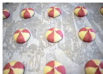
2 Colour Segmented Drops