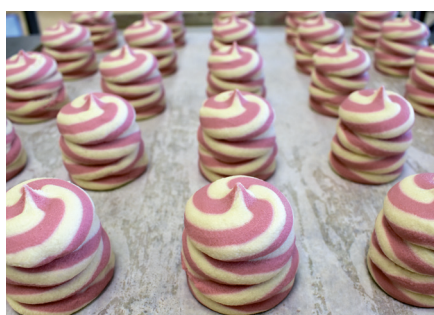
2 Colour Multiple Drops with Alternate Twists