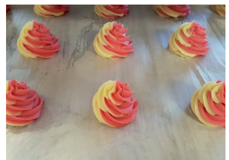
2 Colour Rose with Twist