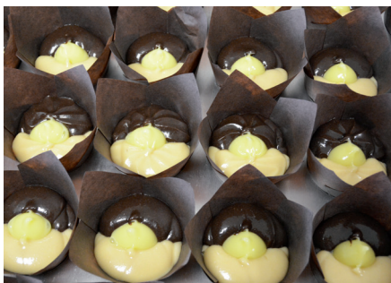
3 Colour Cupcakes

The Ultimate Depositor - Creates Complex Shapes with upto 3 Different Colour Mixes