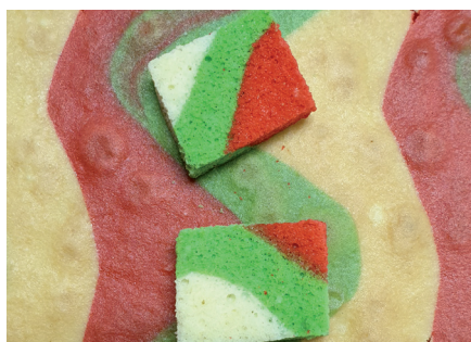
Multi Coloured Random Cake deposits