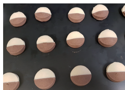
2 Colour Half-and-Half Biscuits